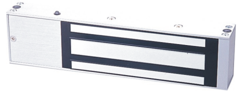
MAG-05000ALS--D MAG-05000ALS-HD MAG-05000ALS-TD